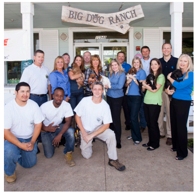
FPL Energy Experts and local contractors helped Big Dog Ranch Rescue animal shelter curb its expenses with an energy makeover.