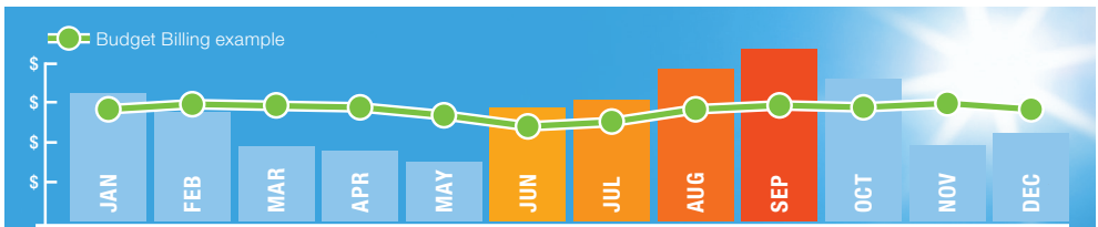
Graph for illustrative purposes only